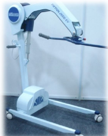
OVERALL DEVICE IN RAISED POSITION.