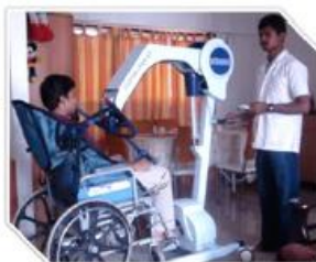
3. TRANSFER TO WC/TOILET

TAKE YOUR HEALTHCARE SERVICE SEVERAL NOTCHES UP. CONTACT US FOR DETAILS