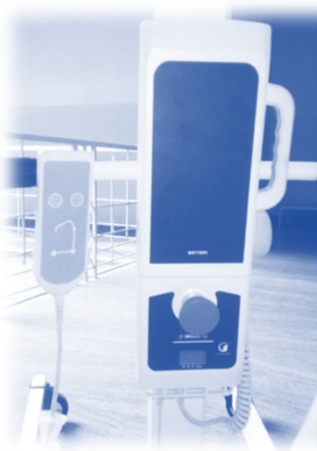
REMOTE & BATTERY BOX WITH INDICATOR & EMERGENCY STOP BUTTON MOUNTED TO BACK OF THE DEVICE.