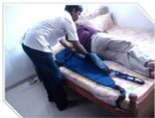
1. PLACE SLING UNDER PATIENT

A unique BATTERY POWERED aid that enables transfer of persons with limited mobility from BED to TOILETS, WHEELCHAIR, SOFA or CAR in 3 SIMPLE STEPS !